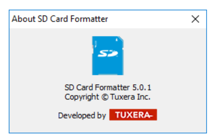
Figure 2: Version information

On Mac OS X/macOS operating systems, click the [SD Card Formatter] menu and then click [About SD Card Formatter].